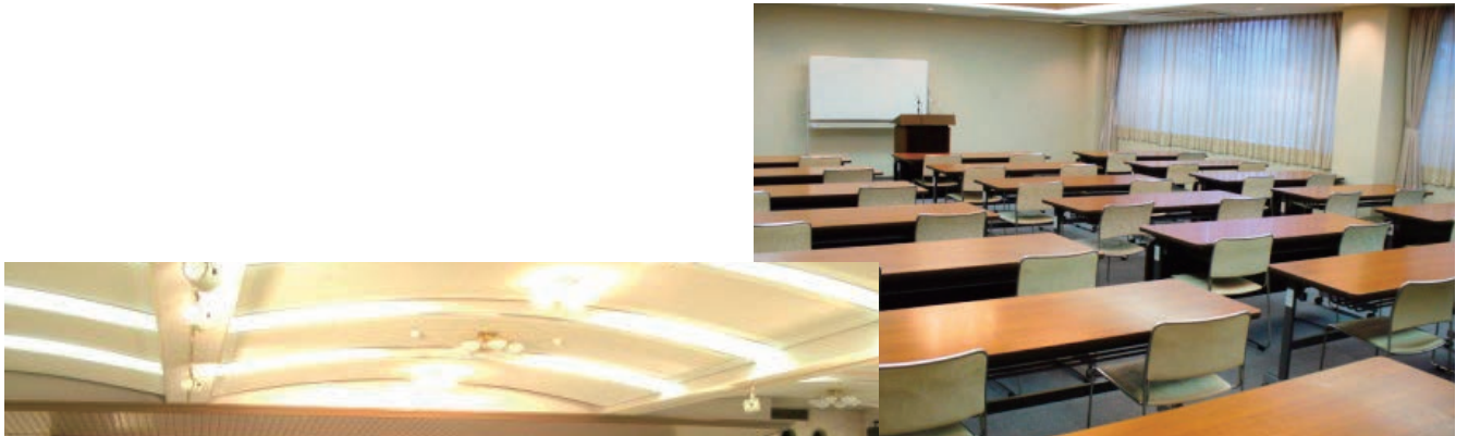
Workshop room 1